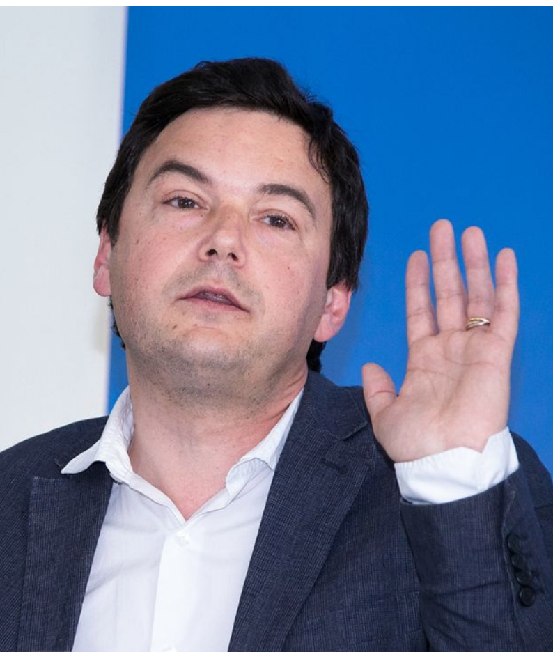
The professor of economics Thomas Piketty cautions against a further drifting apart of the distribution of income and wealth.

Thomas Piketty presented the basic arguments of his international bestseller Capital in the Twenty-First Century in his lecture the professor of the Paris School of Economics stressed the importance of keeping in mind the history of wealth distribution and made the case for a global tax on capital.