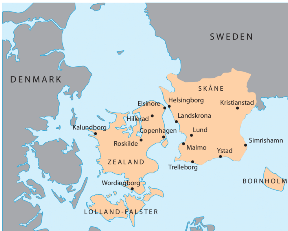
FIGURE 1: Öresund region

The Öresund “region” labels the land areas surrounding the Öresund strait, which constitutes the border between Sweden and Denmark. It covers an area of 20,859 km 2 and consists of roughly three parts: the metropolitan area of Copenhagen, its suburban area, and Scania (Skåne) on the Swedish side (see Figure 1). However, it is important to note that the term “Öresund region” does not describe an administrative region. as relevant political and administrative powers remain firmly embedded in national structures on either side of the national border. The Öresund region is thus not a functional region in the sense of an integrated labor market.