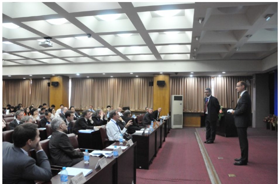
Session: Green Logistics, 2015