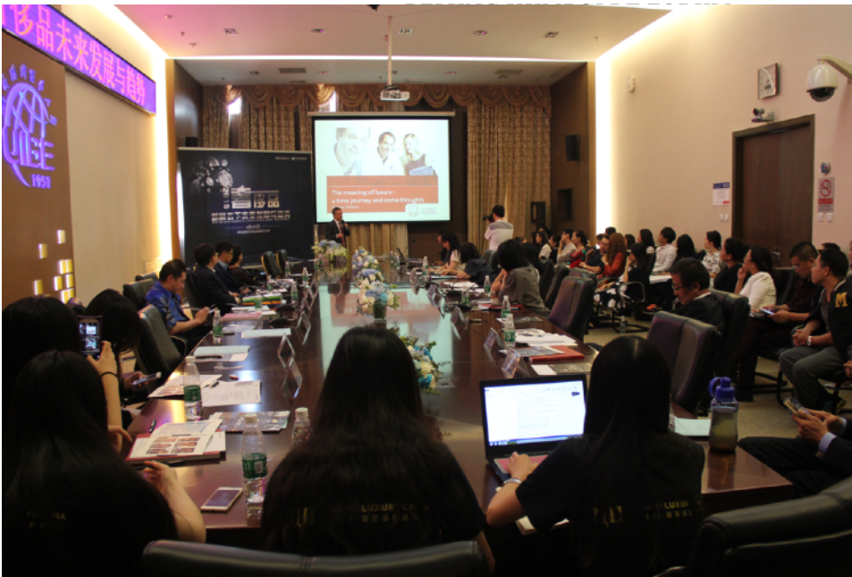
Session: Fashion Management, 2015