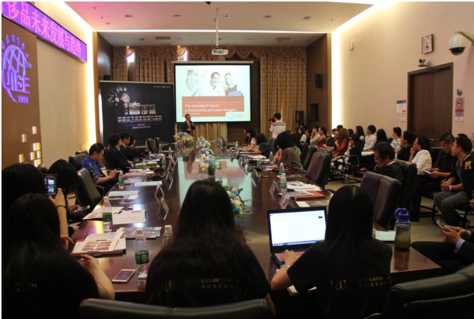
Session: Fashion Management, 2015