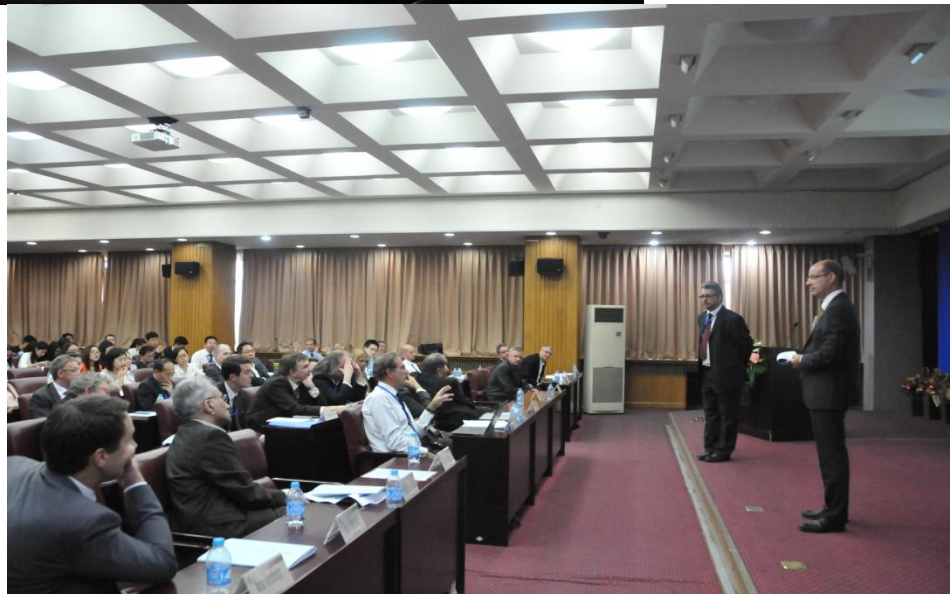
Session: Green Logistics, 2015